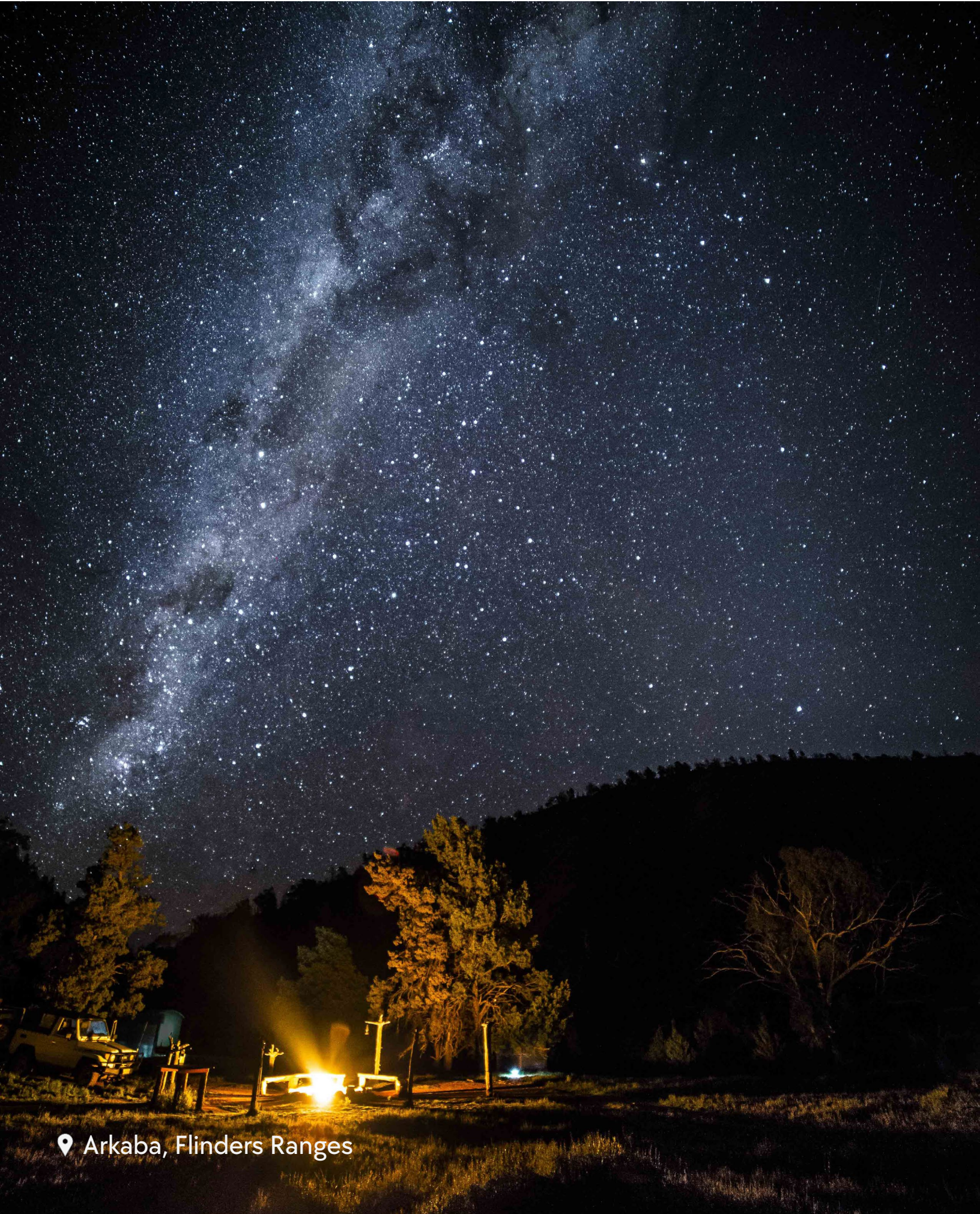
📍 Arkaba, Flinders Ranges