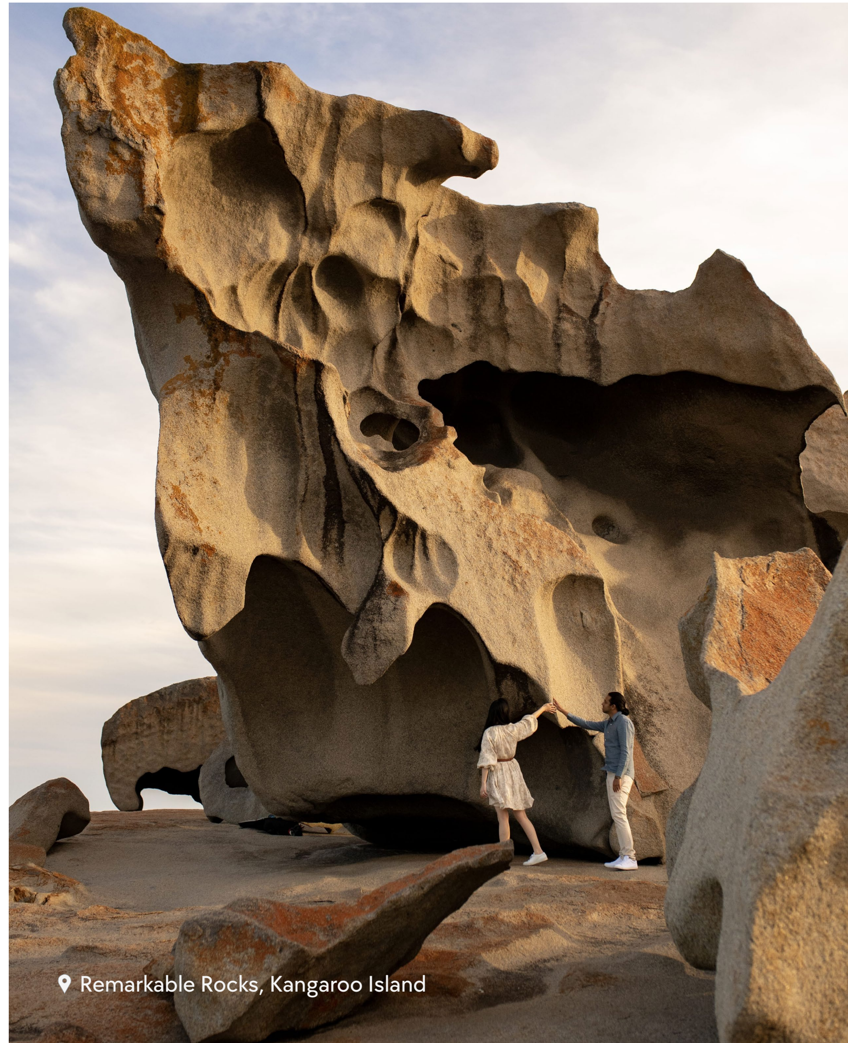
📍 Remarkable Rocks, Kangaroo Island